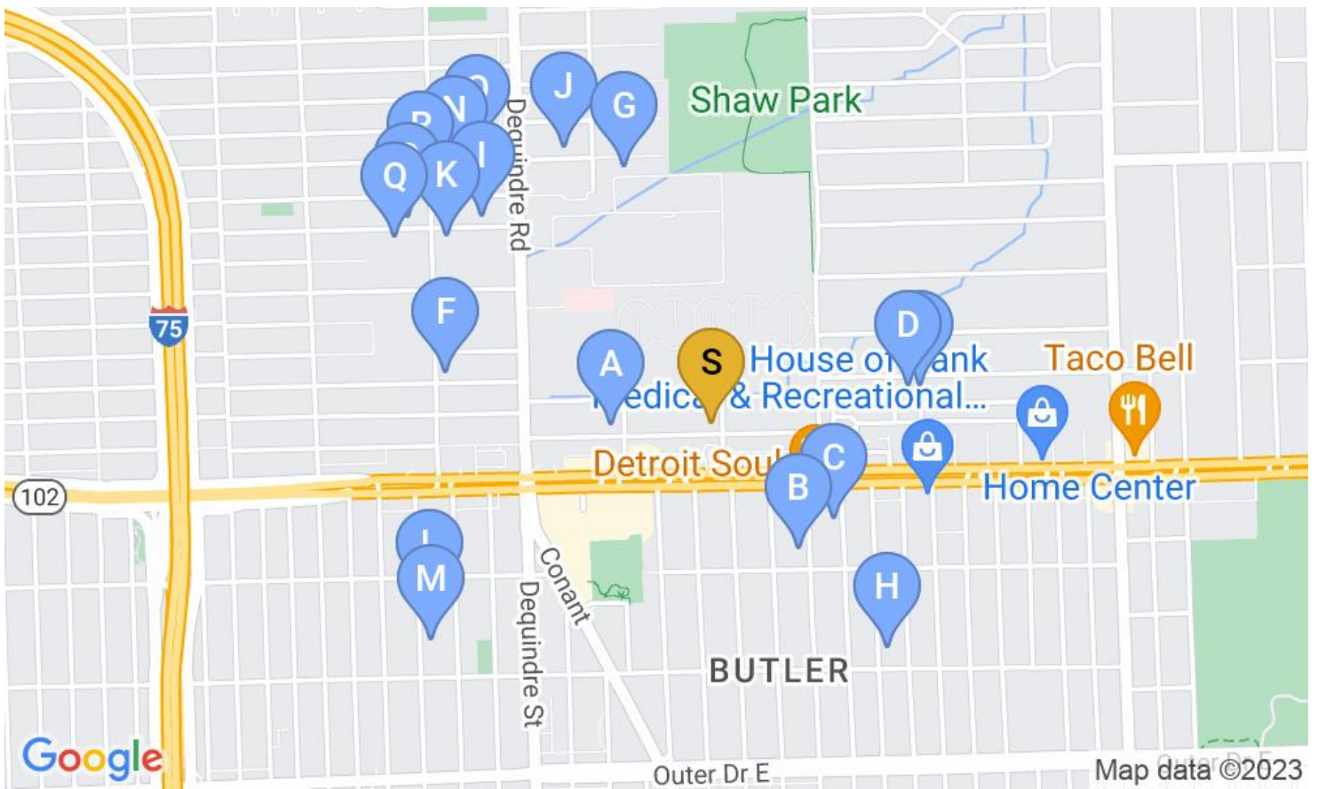
● Subject Property ● Sold Comps ● Active Comps ● Failed Comps